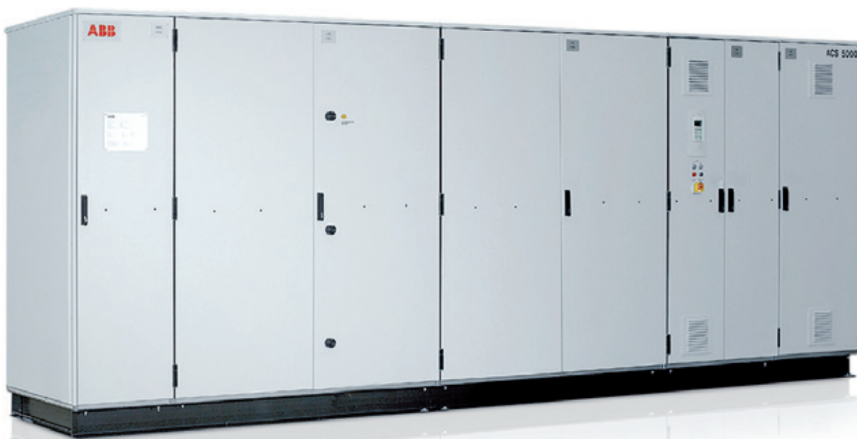
ABB also supplies high speed VSDs for compressors. The combination of a high speed VSD and motor means that the motor can be coupled direct to the compressor without the need for a gearbox. This compact solution reduces maintenance requirements and noise levels and provides considerably higher availability than a conventional solution using a step-up gearbox.

ABB medium voltage drives provide powerful and accurate control of compressor applications. They are available in the power range 315 kW - 100 MW and can be used with induction, synchronous and permanent magnet motors. Compared to mechanical control methods, ABB's electric variable speed drives offer many advantages, including increased availability, better control, and improvements in overall energy efficiency, operational flexibility and maintainability.