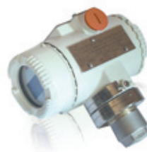
ABB Instrumentation Services delivers the knowledge and global experience required to keep customers' assets operating at maximum reliability and accuracy. We provide a full scope of services, from start-up and commissioning through lifecycle support, and our global strength means we can deliver support wherever and whenever it is needed.

ABB control products are designed to enable interoperability, simplify installation and improve operation and service by offering reliable compressor control solutions.